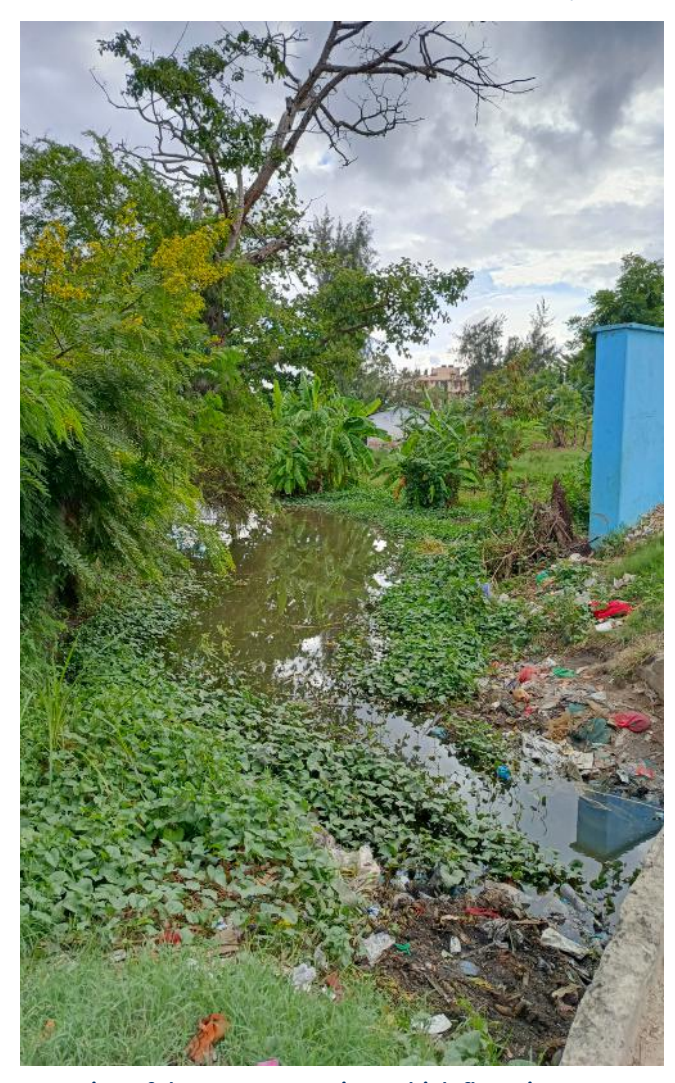
A section of the Mtopanga River which flows into the Indian Ocean at Pirates Beach heavily polluted attributed to human activities like poor waste disposal and management and releasing of raw sewerage into the river.

Tree planting initiatives can only work best if we adopt acreages for rehabilitation because carbon sequestration needs tree plantations and not small spaces with scattered trees. Mombasa County through the Kenya Forest Services can identify designated areas where we need to plant mangrove trees and focus our energy there. This also applies to forest areas which have been degraded and need rehabilitation.