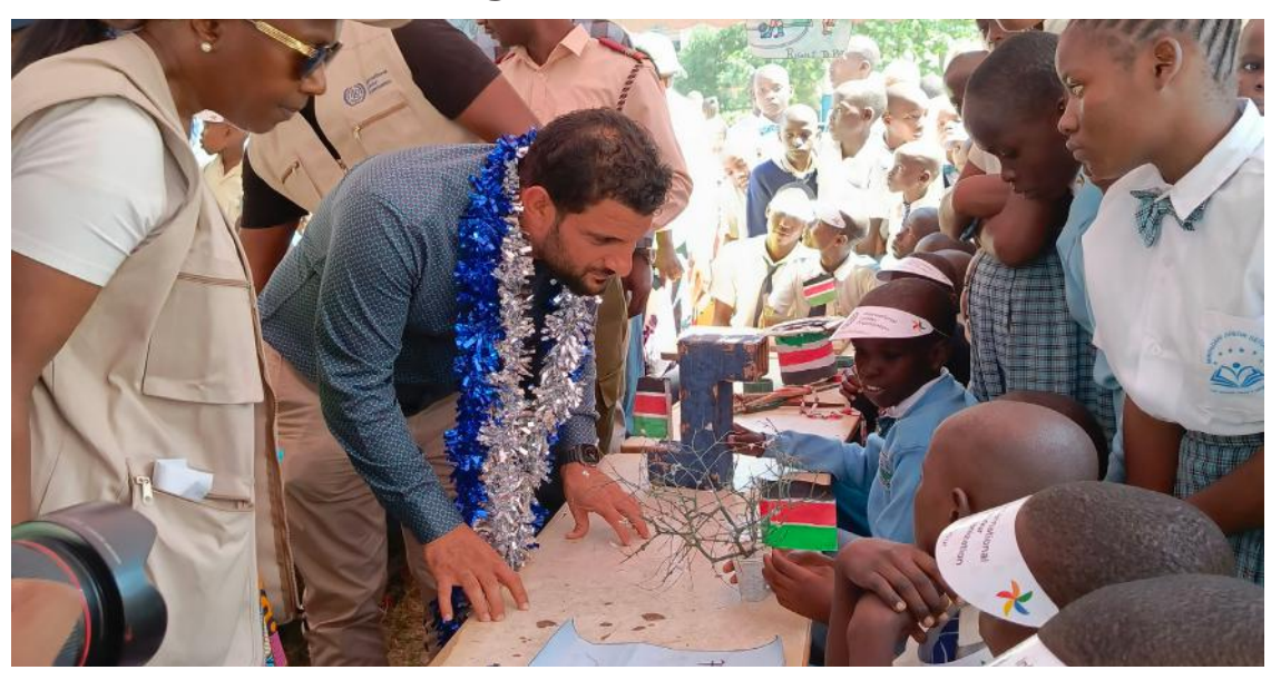
The Guest of Honor, Speaker of the Mombasa County Assembly Hon. Aharub Khatri engaging learners at the exhibition during the World Day against Child Labour celebrations at Mikindani Primary School.

eRise Africa joined other Civil Society Organizations and stakeholders from both the National and County Government in commemorating World Day against Child Labour 2024 at Mikindani Primary School under the theme 'Kenya is Committed to End Child Labour: The time for Action is Now'. The event was supported by the International Labour Organization (ILO) and graced by the Speaker of the Mombasa County Assembly Hon. Aharub Khatri. The celebrations commenced with a procession officially flagged off and led by the Mombasa County Assembly Committee on Labour Chairperson Hon. Jactone Madialo. At Mikindani Primary School, visitors were taken through exhibitions prepared by the learners showcasing their creativity, emphasizing the impact of education in their lives. Mkindani Primary School learners did not disappoint with moving songs and dances to spice up the day.